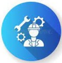
Workforce Readiness & Pre-Apprenticeship

The PHCC Georgia Academy offers a suite of technical training and business education for any size licensed contractor in the Plumbing-Heating-Cooling and Mechanical Industry. From apprenticeship and work ready programs to code updates, plumbing license exam prep and continuing education, our programs will continue to train the next generation of qualified technicians for years to come.