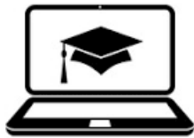
E-Learning & Fast Track