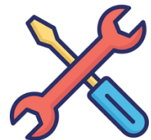
Classroom & Hands-On Labs